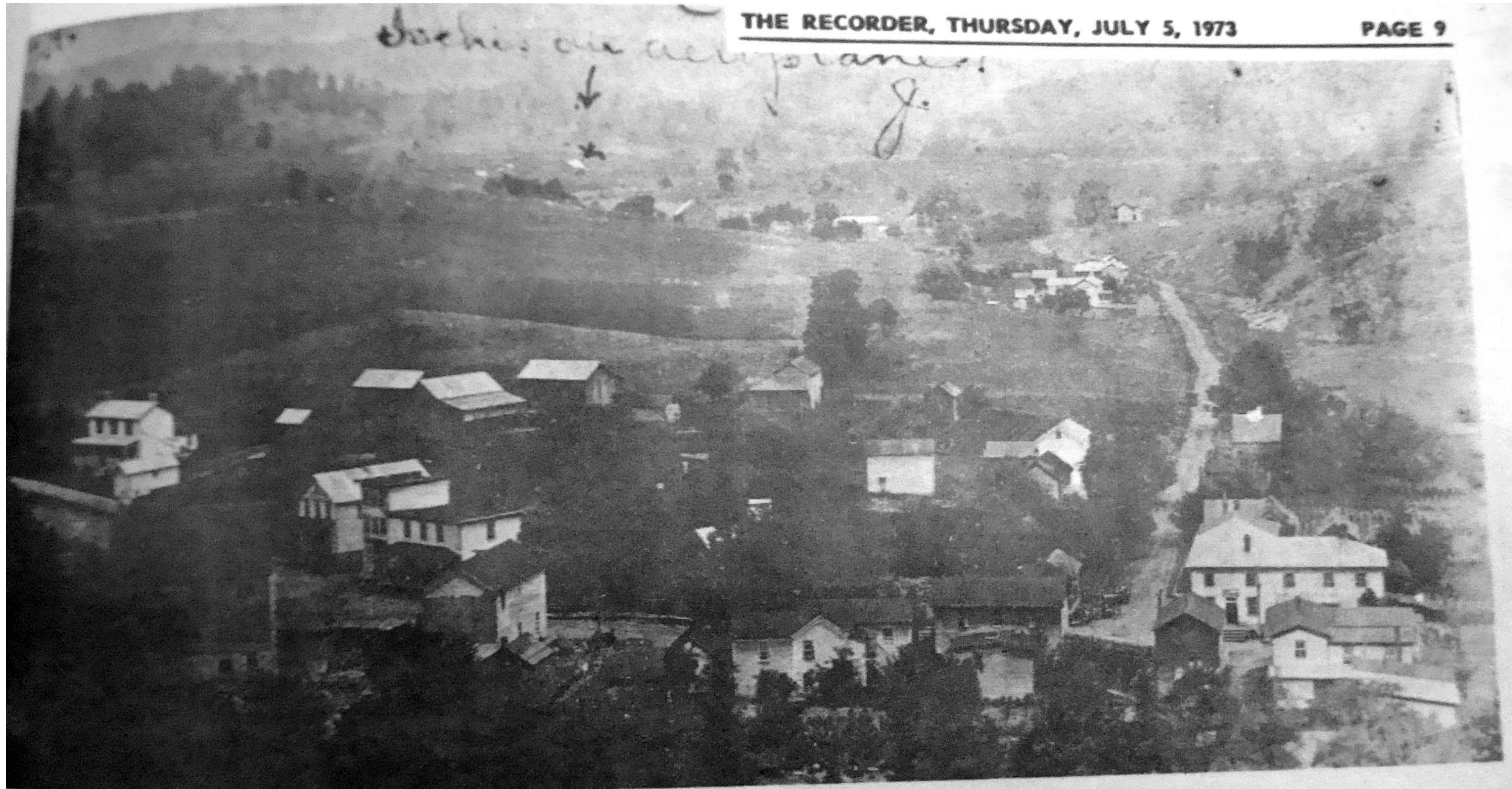
THIS VIEW OF BLUE GRASS, in Highland County, dates to around 1915-16, when that village was known as Crabbottom.